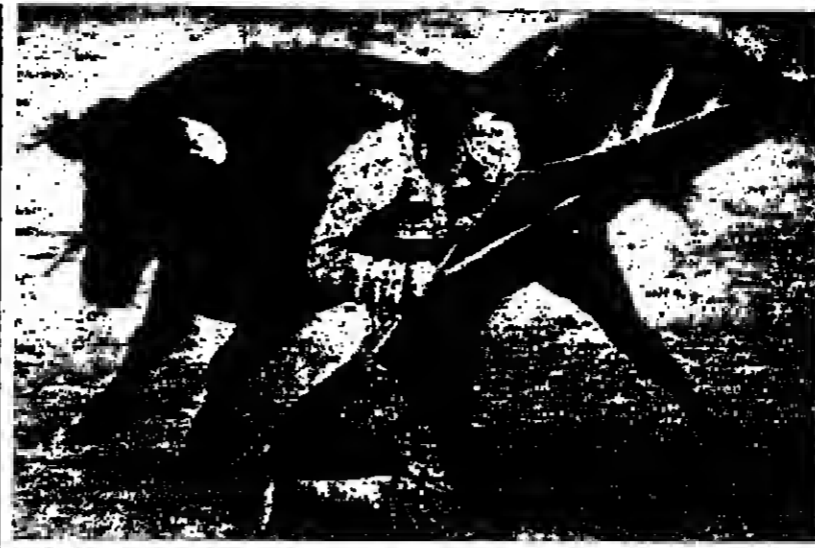
El Cordobes performs the el salto de la ran (the jump of the frog) in Benidorm, Spain, on Sunday. Manuel Benites, Spain's most colorful bullfighter in the 1960's, came back from retirement by killing six bulls in a triumphal one man corrida.